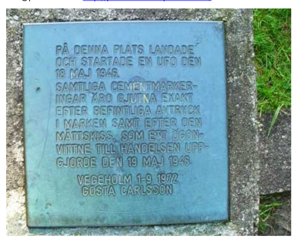
A UFO landed and launched at this location on May 18, 1946 All cement markings were cast exactly according to existing impressions in the ground and according to the sketch that an eyewitness to the event made on 18 May 1946 Vegeholm 1.9 1972 Gosta Carlsson

sold out per. Nov 2002 cf. Clas Svahn, but reprinted and again on sale in the spring of 2015 from the Parthenon - p. til plusgiro 1959-6, Parthenon Förlag: send mail to: info@parthenon.se http://parthenon.shop.textalk.se/