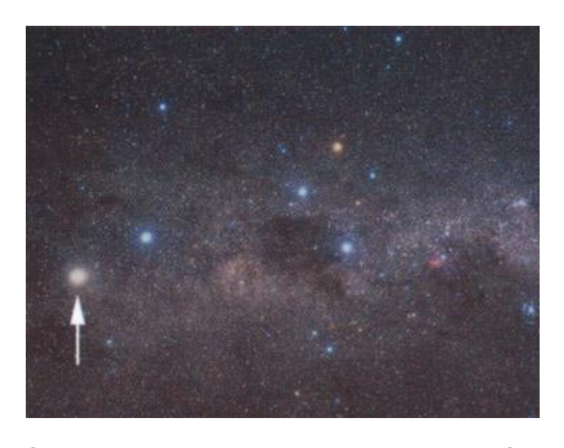
Alpha Centauri is the brightest star in the constellation Centaurus